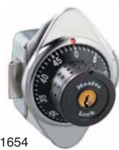
4. #1654 #1655