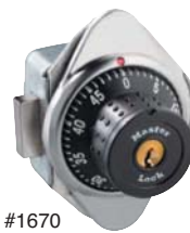
5. #1670 #1671