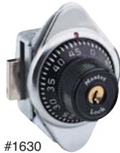
3. #1630 #1631