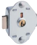
8. #1710 #1710MK