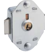
9. #1714 #1714MK