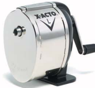
X-ACTO Model L

Cat. No. PS1031 1-11 = $14.00 ea. 12-35 = $13.50 ea. 36+ = $13.25 ea.