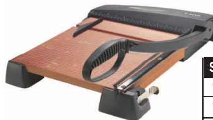
Heavy-Duty Wood Trimmer