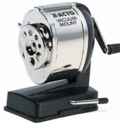
X-ACTO Model 1072 Vacuum Mount

Cat. No. PS1055 1-11 = $27.50 ea. 12-35 = $26.50 ea. 36+ = $26.05 ea.