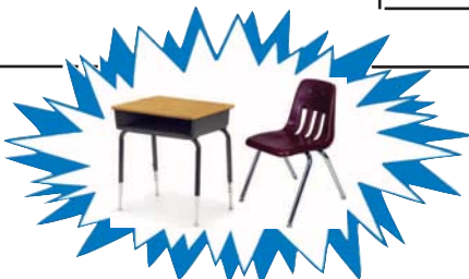
Classroom Furniture See pages 78-81