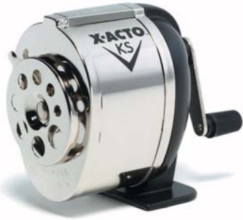
X-ACTO Model KS

Cat. No. PS1031 1-11 = $14.00 ea. 12-35 = $13.50 ea. 36+ = $13.25 ea.