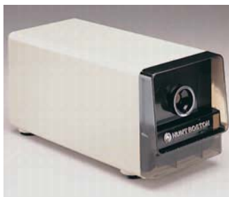
Boston Heavy Duty Electric Sharpener