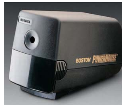
Powerhouse Electric Sharpener