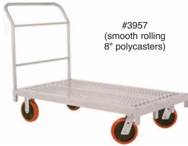
#3957 (smooth rolling 8" polycasters)