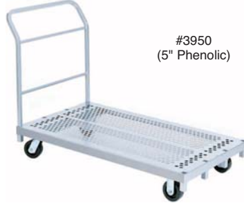
#3950 (5" Phenolic)