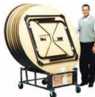
Table Toter has a Money Back Guarantee