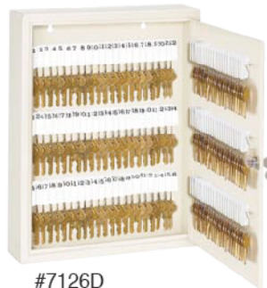
#7126D 120 count shown