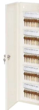
#7124D 50 count shown