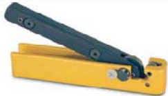
2. #271D $95.00