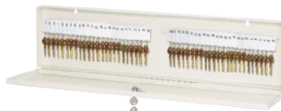
#7123D 48 count shown