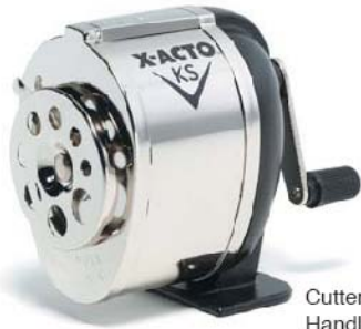
X-ACTO Model KS

Cat. No. PS1031 1-11 = $14.00 12-35 = $13.50 36+ = $13.25