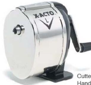
X-ACTO Model L

Cutter - Cat. No. PS1213 - $11.75 ea. Handle - Cat. No. PS1252 - $2.25 ea.