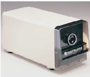
X-ACTO Heavy Duty Electric Sharpener