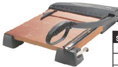
Heavy-Duty Wood Trimmer