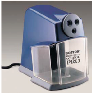
X-ACTO School Pro Electric Sharpener