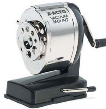
X-ACTO Model 1072 Vacuum Mount

Cat. No. PS1055 1-11 = $29.50 12-35 = $28.50 36+ = $27.95