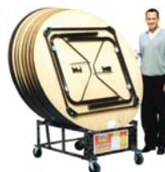
Table Toter has a Money Back Guarantee