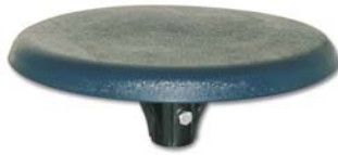
CONE STYLE STOOL TOP